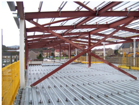
Previous Photograph – metal decking to Ground floor

The photographs below illustrate the progress made.