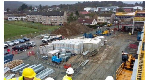
Photograph 5 – Rear playground area used for storage of construction materials

The works are reported by Morrison Construction as being on programme.