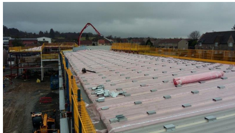
Photograph 4 - Roofing works