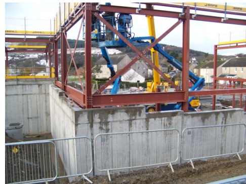
Previous Photograph – start of main steelframe to sports hall